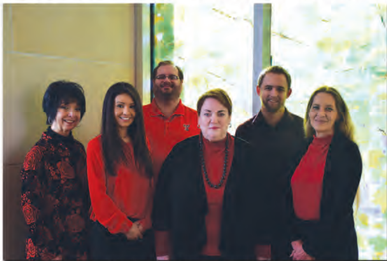
The Burkhart Center Faculty and Staff